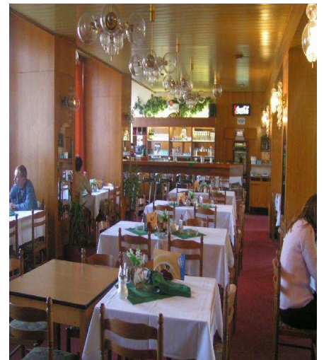
Restaurant City Hotel Bily Lev