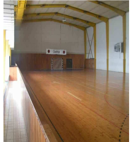
Sport hall Rokycany

In Rokycany are some comfortable bars and a Disco. We can also recommend you to go to Pilsen which is about 10 km away. Pilsen is the second biggest city in the Czech Republic and the night-life is near same like in Prague. However, the entrance is free and the drinks are much cheaper than in Prague.